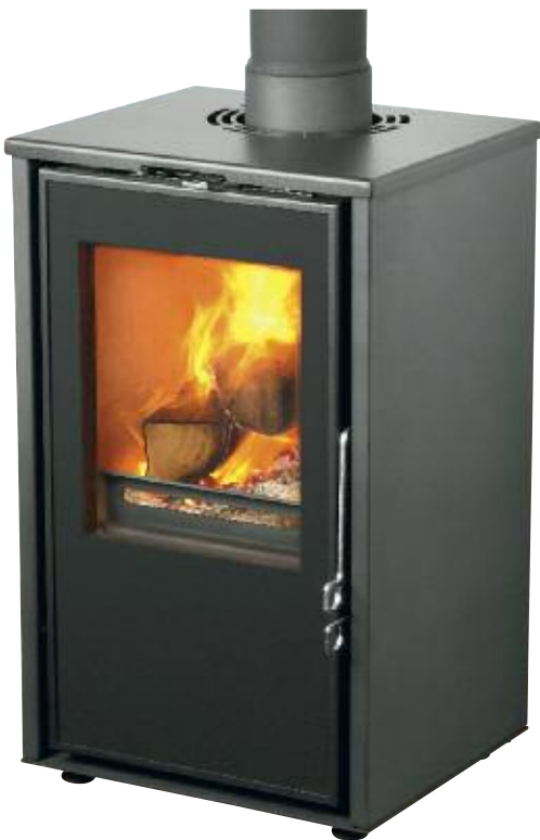
Serenity 40FW full length glass window