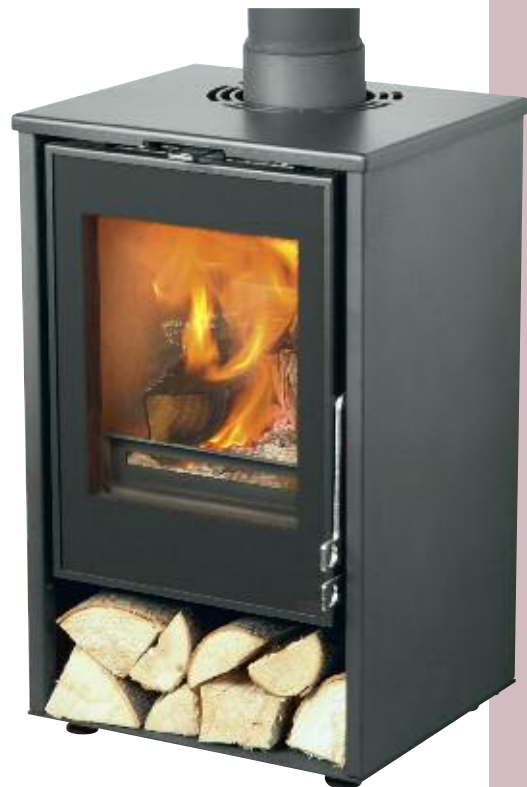
Serenity 40LS log store