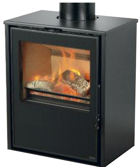
Serenity 50FW full length glass window