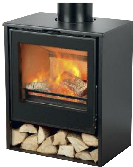
Serenity 50LS Log Store